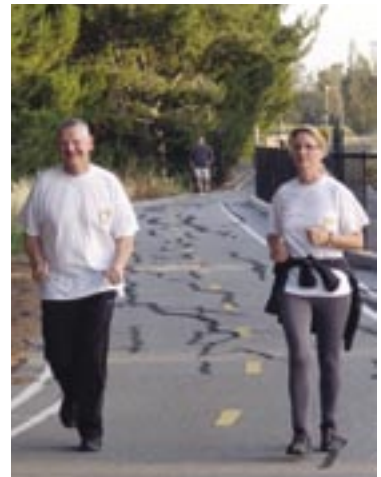
Our 2009 5K Fun Run participants.